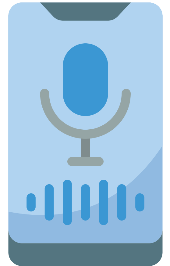
Alt Text - A dictation software on a mobile

Whether you are a person with disability, a government agency wanting to share news far and wide, an influencer wanting to make sure your content is enjoyable for all, or a young person communicating with your college friends, you'll find all the information you need in this curriculum.