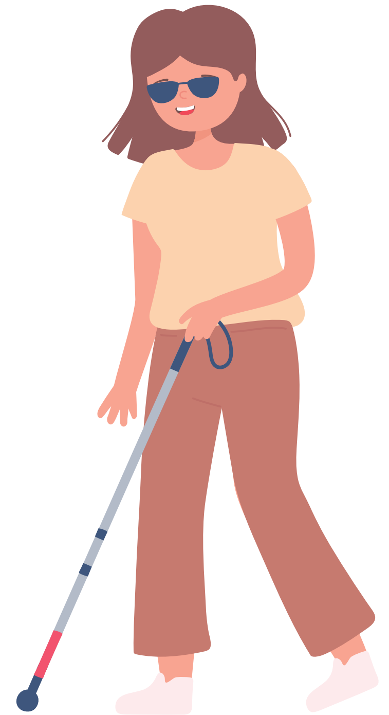
Alt Text - A graphic showing Ria dressed up and using her SmartCane

What role has social media or technology played in your stories?