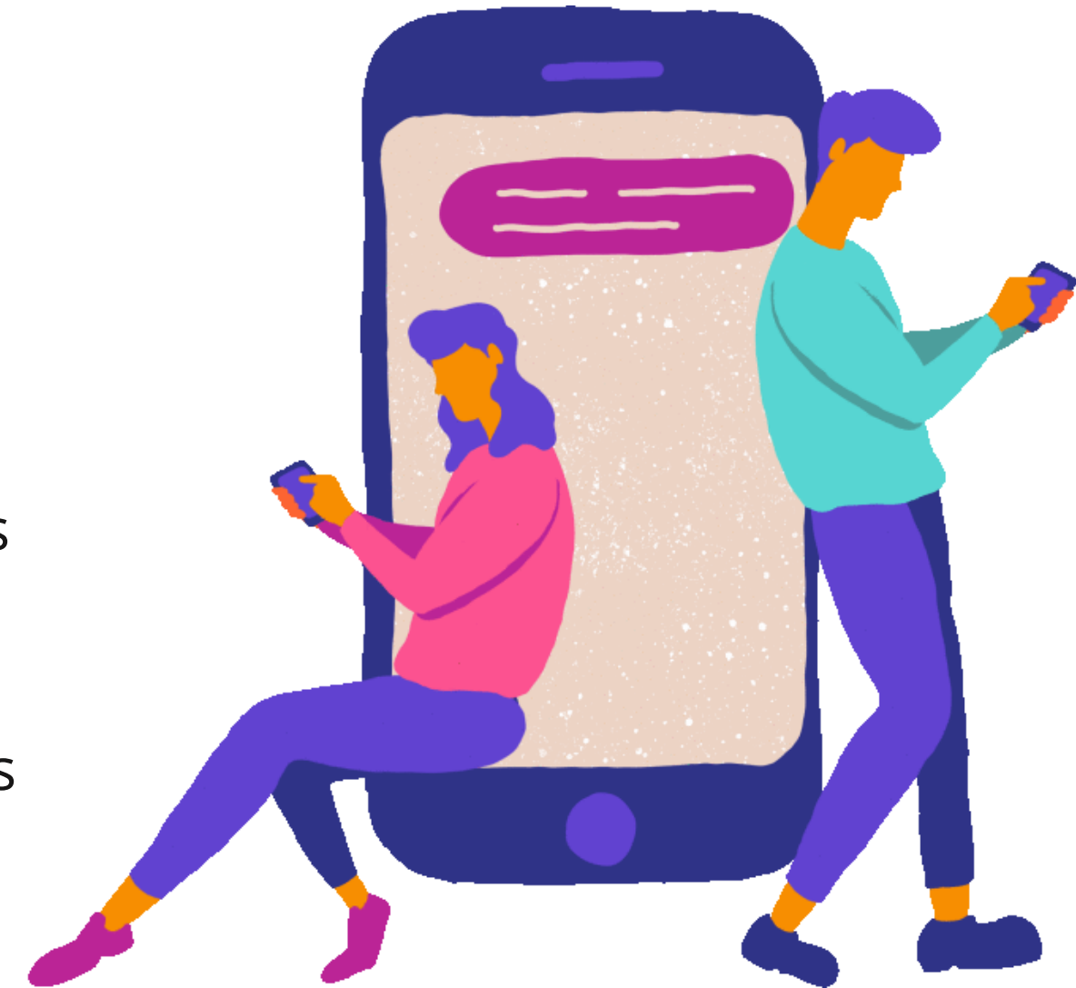
Alt Text - A boy and a girl sitting next to a big mobile phone as they exchange texts

It is of great importance that social media and information and communication is available to everyone so that we can all enjoy what it has to offer and utilize its potential. Unfortunately, many studies show that some groups who may have diverse needs do not get to enjoy social media or the communication it offers on an equal basis with others.