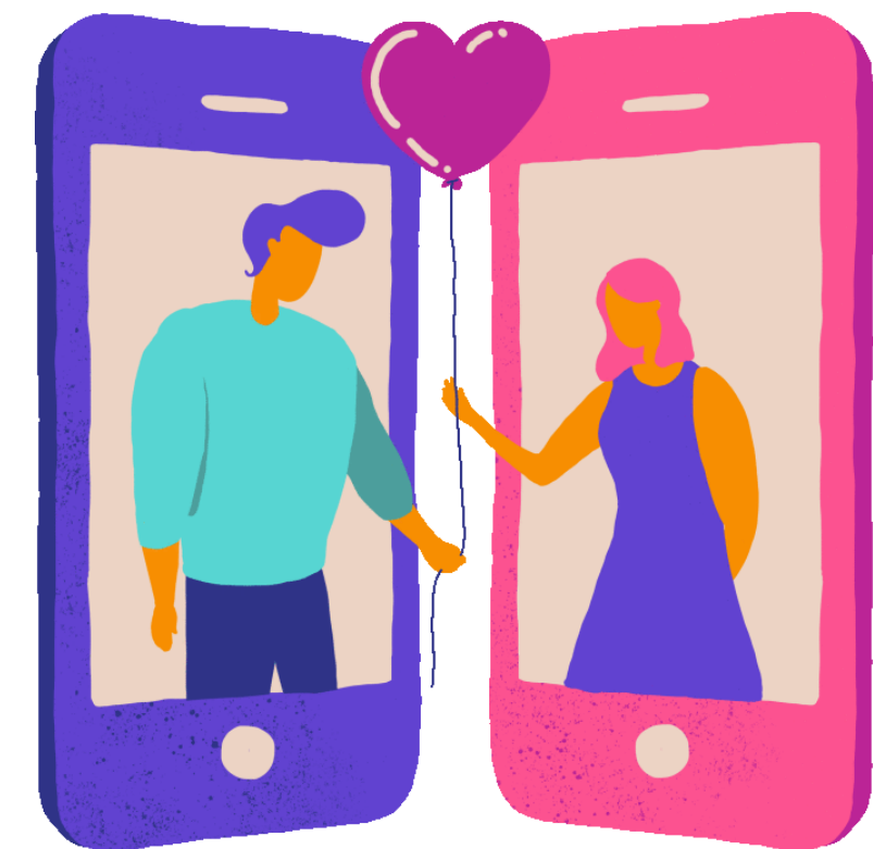
Alt Text - A boy and a girl giving a balloon to each other through their mobile screens

Are you ready to become agents of change? We are excited to be on this journey with you and can't wait to get started! Explore the tips and guidelines in this curriculum to see how you can play your part in making sure every conversation remains accessible and join us as we make social media a more inclusive and accessible space for all.